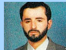
Abu Faraj al Libbi

4/30/2005 Abu Faraj al Libbi , Pakistan to Afghanistan, N4476S (N313P re-registered)